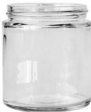
3.5 oz Straight Sided Jar