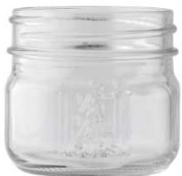
4 oz Mason Jar