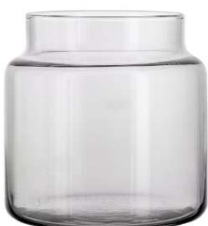
16 oz Apothecary Jar