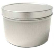
3 oz tin