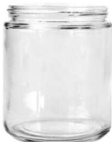
7 oz Straight Sided Jar