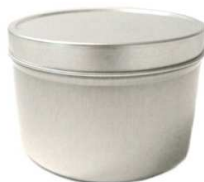
4 oz tin