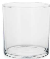
9 oz Tumbler